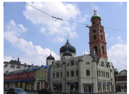
Pic. 2. Trinity Church, 2009