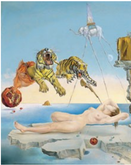
Figure 1. Salvador Dali, “Dream Caused by the Flight of a Bee Around a Pomegranate a Second Before Awakening” (1944)

The ‘ground theory’ of visual perception helps to explain, for instance, the effect achieved in the surrealist painting by Salvador Dali in his “Dream Caused by the Flight of a Bee Around a Pomegranate a Second Before Awakening”, which depicts a reclining nude hovering in her sleep above a tiny flat island in a boundless sea. She is threatened by a flying monster of a fish and two giant tigers which emerge from a pomegranate hanging in transparent air close to the horizon. Such location of the pomegranate endows it and the ferocious creatures respectively with huge dimensions (cf. Fig. 1):